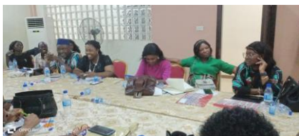
Participants during the Session