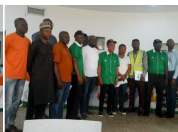
The National Officers in a pose with the Branch Executives