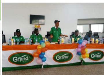
National President addressing the Members

In the same vein, the resuscitation of Grand Cereal Limited serves as a testament to the resilience and determination of the workers, who have remained steadfast in demanding the recognition of their fundamental rights to union membership. This development is undoubtedly a cause for celebration and optimism within the FOBTOB Family and the comity of trade unions.