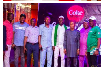
Participants at NBC Election