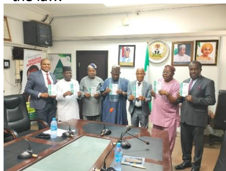
The Director, TUSIR, and the Stakeholders in the Food, Beverage & Tobacco Industry, at the presentation

The Honourable Minister of Labour appended his signature to the document, giving it the backing of the law.