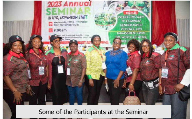
Some of the Participants at the Seminar

violence and harassment in the workplace in Nigeria. It is hoped that more such events will be organized to empower women to further emancipate for the elimination of gender-based violence and harassment in the workplace.