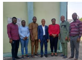
The HRD of International Breweries Plc flanked by the National President and Executive Secretary

Representatives of the Management of International Breweries Plc, as well as British American Tobacco Company, and CWAY Food and Beverages Nigeria Company Limited paid courtesy visits to the FOBTOB National Secretariat on three separate occasions: Wednesday, December 13th, 2023; Friday, December 15th, 2023; and Tuesday, December 19th, 2023, respectively. The objective of the visits was to strengthen the relationship between FOBTOB and the individual management teams. The National President was on hand to receive the