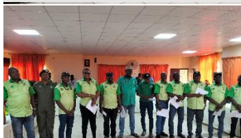
7Up Bottling Company Ltd. newly elected Branch Executives