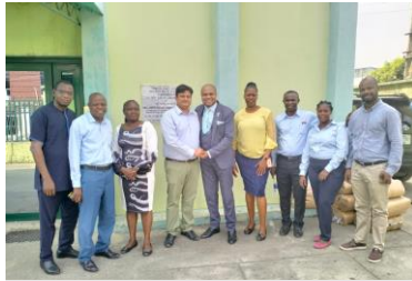
The Cway Management and Members at the National Secretariat.

Management representatives. He lauded the initiative of the companies and noted that the visits demonstrated the importance of partnership between FOBTOB National and the respective Companies.