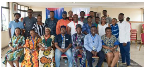
A Group Photograph of the participants.