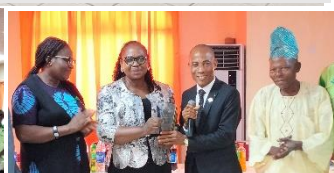
Head of People & Culture, 7Up Bottling Company Ltd. received an Award at the event