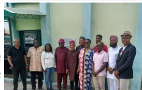
The CWC Members, British American Tobacco Management, and the Branch Members.