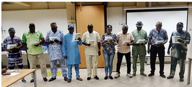
Nestle Nigeria Plc Branch Executives members while taking the Oath of Office.

We wish both Branch Executives successful tenures.