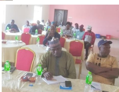
TRAINING IN SESSION