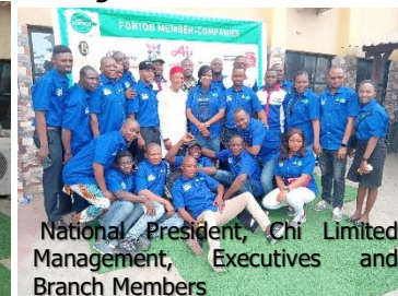
National President, Chi Limited Management, Executives and Branch Members