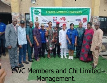
CVC Members and Chi Limited Management.