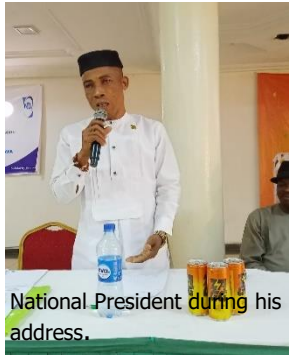
National President during his address.