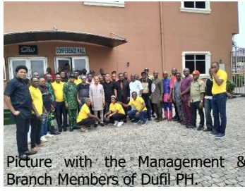
Picture with the Management & Branch Members of Dufil PH.