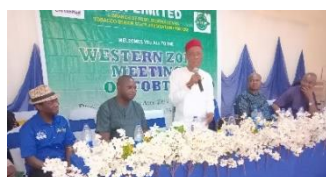
National President during his address.

The National President speech was full of appreciation to the Management of Chi Limited Branch for their cooperation with the Branch. He commended the Management for lifting the embargo on some categories of Staff from joining the Union. He expressed the hope that the implementation